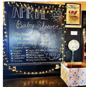
Clancy's Irish Pub

In addition, a special thank you to Clancy's Irish Pub, Genesis Church, St. John's Gildehaus, the Wednesday Club of Eureka, Honeybee Flower Truck and Most Sacred Heart Pro-life Chairs for doing diaper drives recently. Our ability to provide these items is greatly supported by the abundant material donations from these community organization.