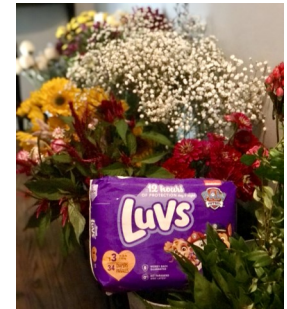
Honeybee Flower Truck